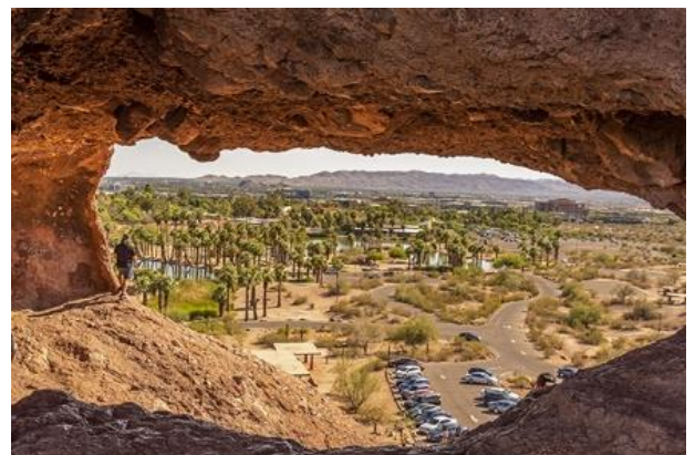
Hole in the Rock at Papago Park Phoenix, Arizona

This closes out the year 2021 for my photography.