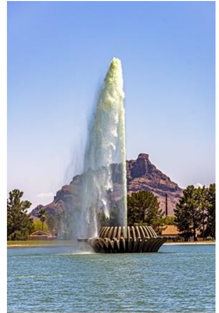
World's Famous Fountain at Fountain Hills

We went to the Carefree Desert Gardens in Carefree. It is an interesting desert biological garden with a fountain and has one of the largest sun dials in the world. I managed to get the whole sun dial in with my fisheye lens which covers 180-degree view. See photo.