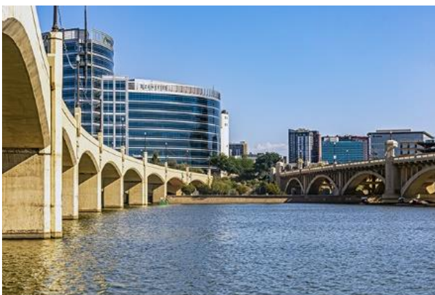
Tempe Skyline from Mill Avenue Bridge on Tempe Town Lake

Hole in the Rock is an interesting geological formation located between Phoenix and Tempe. You can see this formation at Papago Park in Phoenix.