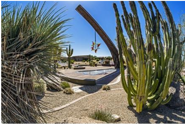
Sundial at Carefree Desert Garden